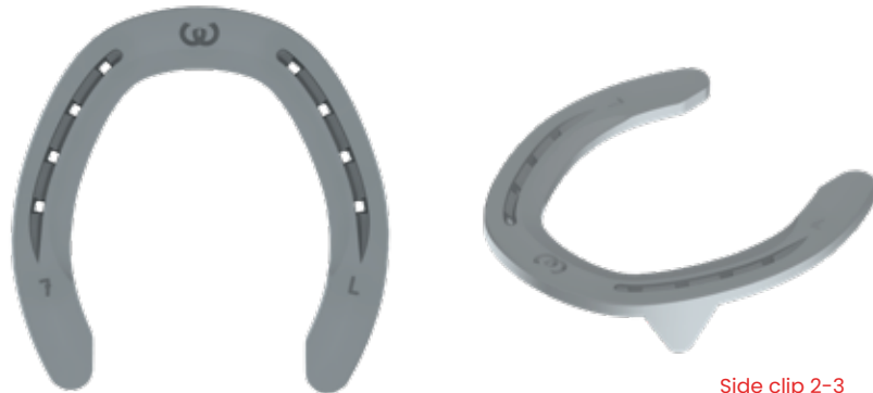
Side clip 2-3